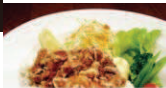
KARAAGE DON $16 Marinated Fried Chicken thigh on rice