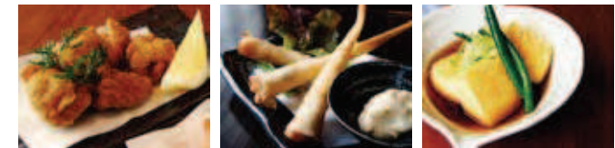
Salt & pepper squid Crispy prawn roll Agedashi Tofu (2pcs)

(Seared salmon and Beef tataki are available from 6pm)