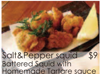
Salt & Pepper squid $9 Battered Squid with Homemade Tartare sauce