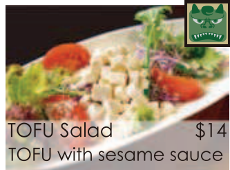
TOFU Salad $14 TOFU with sesame sauce