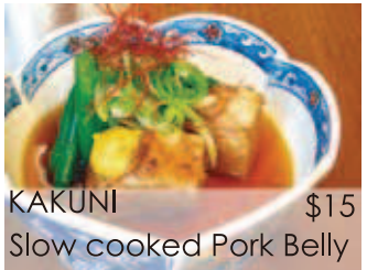
KAKUNI $15 Slow cooked Pork Belly