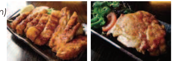
Crumbed Chicken TERIYAKI Chicken