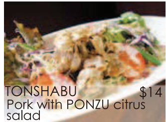
TONSHABU $14 Pork with PONZU citrus salad