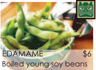
EDAMAME $6 Boiled young soy beans