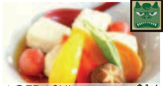
AGEDASHI $14 Fried fresh TOFU w seasonal vege in soupy sauce