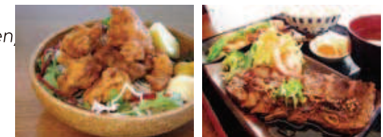
KARAAGE Sirloin Steak