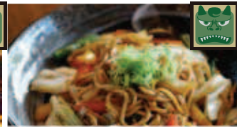
YAKI SOBA $16 Stir fried noodles with vegetarian or Seafood