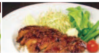
Sauce KATSU DON $16 Panko crumbed Chicken or combination of Seafood