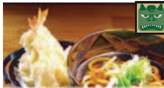
Mix TEMPURA on Rice $17 With Udon noodle soup $18