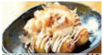
TAKOYAKI $10 Fried Octopus balls